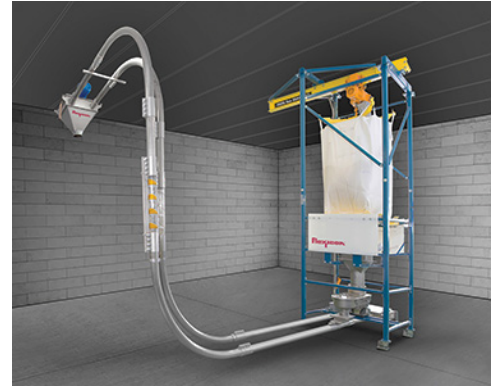
The automated Bulk Bag Weigh Batching System from Flexicon meters ingredients from a Bulk Bag Discharger into a FLEXI-DISC® Tubular Cable Conveyor that transports batches of a specified weight to a downstream process.

The conveyor can accommodate multiple metered inlets for primary ingredients and non-metered inlets for minor ingredients, as well as multiple full-flow outlets and valved outlets for selective distribution of materials.