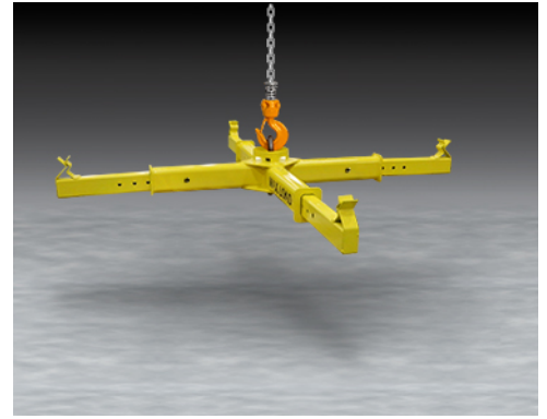
New bulk bag lifting frames in 2.2 ton (2 tonne) capacity (shown) and 1.1 ton (1 tonne) capacity feature telescoping arms that accommodate bulk bags from 32 to 47 in. (81 to 119 cm) square.

Other dischargers offered by the company include BFF models with a lifting frame for forklift loading of bulk bags, low-profile BFH half frame models that require a forklift or plant hoist to suspend the bag during unloading, and BFX split frame unloaders that allow loading of the upper frame on the plant floor, and then forklifting it onto the sub frame within several inches/centimeters of the ceiling.