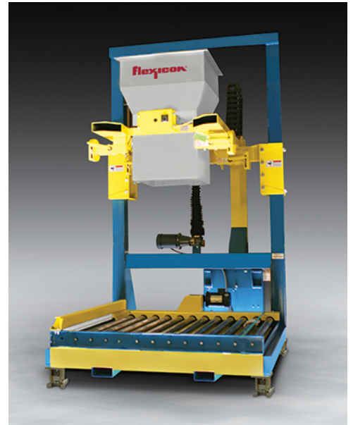
Flexicon's new Wide-Inlet Bulk Bag Filler allows rapid filling and passage of large, moist or dense chunks and semi-solids into open or duffle top bulk bags.

The company also offers patented TWIN-CENTERPOST™ bulk bag fillers for low volume, low cost filling applications, and patented SWING-DOWN® bulk bag fillers that lower and pivot the fill head to the operator at floor level for safe, rapid bag connections.