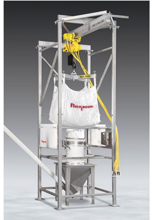
Flexicon's BULK-OUT® Bulk Bag Discharging System features a pneumatically-powered hoist and trolley that eliminates the risk of potential sparks from electrical equipment or fork trucks otherwise used for this function.

Flexicon also manufactures BFF-Series dischargers equipped with top-mounted receiving cups and a removable bag-lifting frame for forklift loading of bulk bags, as well as BFH half-frame models that rely on a forklift or overhead hoist to suspend the bag during discharge.