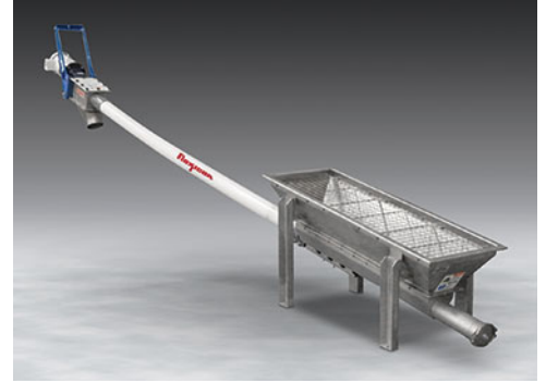
A new Flexicon® flexible screw conveyor with trough hopper accommodates multiple outlets of feeders, grinders and other upstream equipment.

Smooth, crevice-free surfaces of the screw and tube interior allow in-place flushing with water, steam or cleaning solutions through a lower clean-out cap and/or upper discharge housing. The flexible screw can also be removed through the clean-out for separate sanitizing and inspection of the polymer conveyor tube and stainless steel hopper, as well as the screw.