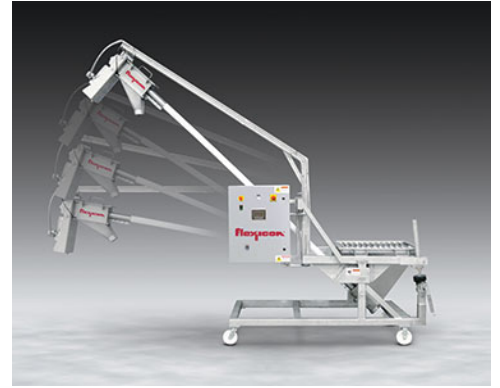
Flexicon's Mobile Sanitary Flexible Screw Conveyor can be tilted down to clear doorways 7 ft (2134 mm) in height, and rolled through aisles as narrow as 42 in. (1067 mm).

The conveyor frame can be finished to sanitary or industrial standards, or constructed of carbon steel with durable industrial coatings.