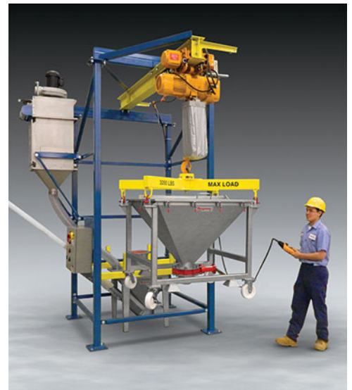
Flexicon's IBC Discharger raises and positions rigid Intermediate Bulk Containers without the use of a forklift, makes a dust-tight connection to a surge hopper available with outlets to charge a flexible screw conveyor (shown), tubular cable conveyor or pneumatic conveying system.

All material contact surfaces of the system are of stainless steel with the exception of the flexible screw conveyor's polymer outer tube.