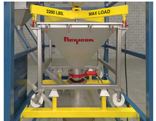
The portable IBC is fitted with eye bolts for connection to the lifting cradle, and inverted cradle cups that center the tapered outlet cone of a butterfly valve within the gasketed receiving ring of the surge hopper.