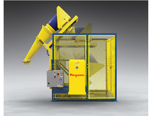
TIP-TITE® Drum Dumper with elongated discharge cone seals the drum rim before tipping the drum, seating the spout of the discharge cone against a gasketed receiving ring on vessel lids for dust-free discharging.

Available in stationary and mobile configurations, the Drum Dumper is offered in carbon steel with durable industrial finishes, with material contact surfaces of stainless steel or in all-stainless steel finished to food, dairy, pharmaceutical or industrial standards. A diameter adapter allows for the safe and dust-tight dumping of smaller-diameter drums.