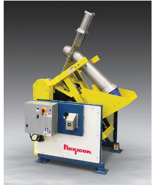
Flexicon's TIP-TITE® Pail Dumper handles pails containing up to 750 lb (340 kg) of high density bulk materials.

The pail dumper is constructed of carbon steel with durable industrial finishes, with material contact surfaces of stainless steel. Other models are available in all-stainless steel finished to food, dairy, pharmaceutical or industrial standards.