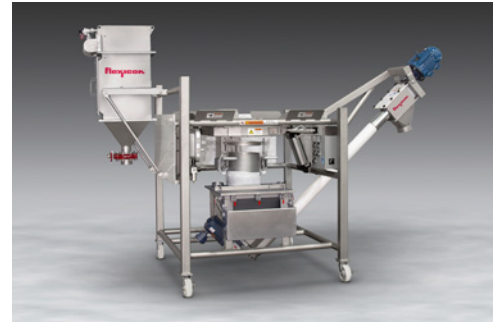
Flexicon mobile half-frame Bulk Bag Discharger with manual Bag Dump Station and integral Flexible Screw Conveyor can serve multiple functions throughout the plant.

The system is offered in all-stainless construction (shown), with stainless material contact surfaces, or in carbon steel with durable industrial coatings.