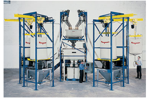
Automated system is comprised of four bulk bag unloaders equipped with flexible screw conveyors, a central gain-in-weight hopper and a ribbon blender that discharges into shipping containers.

Flexicon also offers bulk bag loss-of-weight batching systems comprised of individual or multiple bulk bag unloaders mounted on load cells, which measure weight loss of the entire unit.