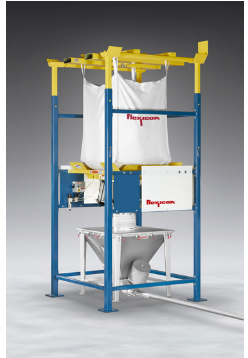
Flexicon BFF Series Bulk Bag Discharger promotes total evacuation into vacuum conveying lines, dust-free.

The unit is constructed of carbon steel with durable industrial finish, or in stainless steel finished to sanitary or industrial standards.