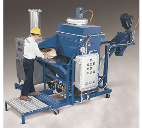
System integrates a hopper, dust collector, bag compactor and conveyor

Integrating system components capable of containing dust during dumping and compaction of bags as well as the conveying of dusty materials can address issues of plant hygiene more effectively than can separate equipment and, with the addition of an explosion-proof electrical system, allow it to handle flammable as well as hazardous and non-hazardous materials throughout the plant.