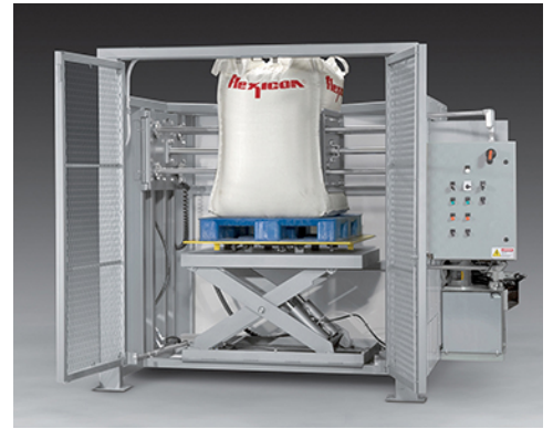
Stainless Steel Bulk Bag Conditioner with programmable scissor lift and automated turntable raises, lowers and rotates the bag in any degree for complete conditioning on all sides at all heights.

The system controller and hydraulic pump can be mounted remotely or on the exterior of the safety cage, and requires only an electrical power connection for operation.