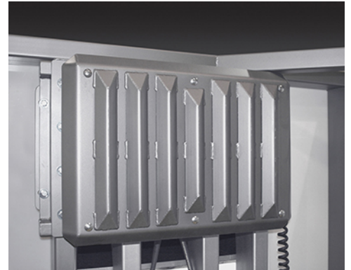
Conditioning plates are offered in standard and custom profiles matched to specific materials and bag designs.