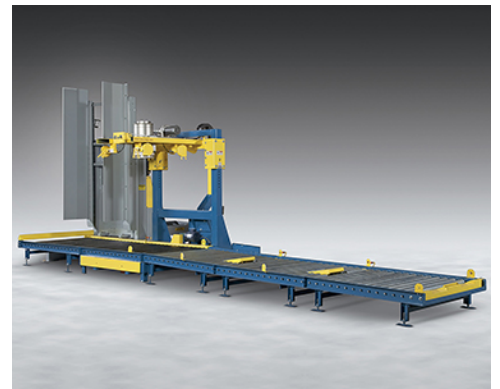
A 15-pallet dispenser releases the bottom-most pallet to roll beneath the cantilevered fill head of a bulk bag filler. Following manual connection of empty bags to the fill head, filling, densification and conveying functions are automatic.