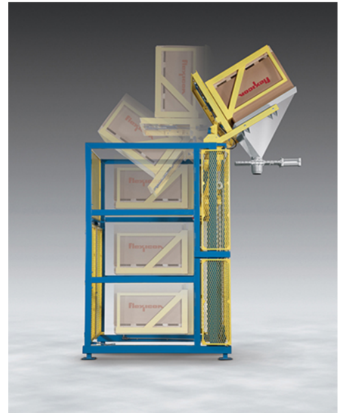
Container platform of TIP-TITE® High-Lift Box/Container Dumper raises to form dust-tight seal between container and discharge hood before the assembly is raised vertically and then tipped, mating the hood outlet with the gasketed inlet port on any receiving vessel 6 to 10 ft (183 to 305 cm) high.

Optional receiving hoppers configured with the company's mechanical or pneumatic conveyors are available to transport discharged material to any plant location.