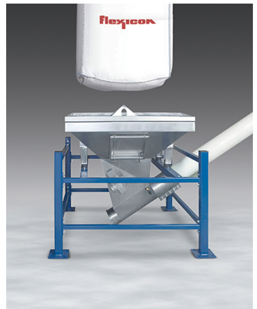
Low-cost, low profile, Single-Trip Bulk Bag Unloader pierces bottom of single-use bags rapidly, and conveys material to downstream processing, storage or packaging equipment.