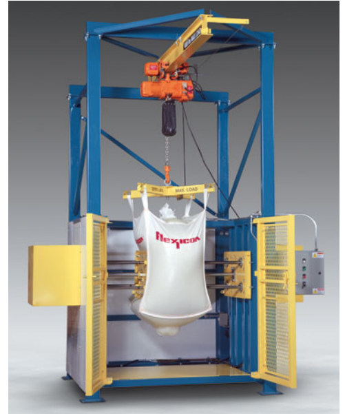
Bulk bags can be loaded, raised and lowered using the hoist, and rotated manually, for conditioning at all heights on all sides.

The conditioner is offered as a stand-alone unit or integrated with the company's BULK-OUT® bulk bag discharging systems.