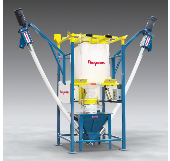
This Flexicon BULK-OUT® Bulk Bag Unloader promotes total discharge from bulk bags, as Dual Flexible Screw Conveyors feed downstream processes separately or simultaneously.

The system is available in carbon steel with durable industrial coating, or stainless steel finished to industrial, food, dairy or pharmaceutical standards.