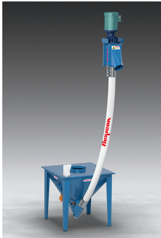
Flexicon Flexible Screw Conveyor Model 1450 can handle diverse materials ranging in size from large pellets to sub-micron powders with no separation of blends.

Model 1450 is available with an optional UL listed start-stop control panel and a range of flow-promotion devices, and is available on a Quick Ship basis in the Americas and in Europe.