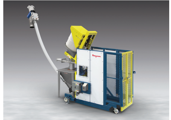
New mobile TIP-TITE® Drum Dumper with safety-interlocked cage dumps bulk solid materials from 30 to 55 gal (114 to 208 liter) drums at multiple locations- automatically with no dusting or danger associated with sudden shifting of contents.

Constructed of carbon steel with stainless steel material contact surfaces, the unit is also available in all-stainless steel finished to food, dairy or pharmaceutical standards. Optional cone adapters allow for safe, dust-tight dumping of small-diameter drums and pails.