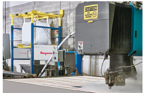
JET-FEED™ Garnet Delivery System eliminates worker fatigue, potential injury, labor, spillage, dust, downtime and higher material cost associated with manual bag dumping.