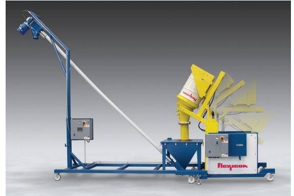
Mobile TIP-TITE® Drum Dumper and FLEXICON® conveyor can perform a diversity of tasks independently or in tandem throughout the plant.

Ready to plug in and run, it is constructed of carbon steel with a durable industrial finish, and is available with stainless steel material contact surfaces or in all-stainless construction finished to food, dairy, pharmaceutical or industrial standards.