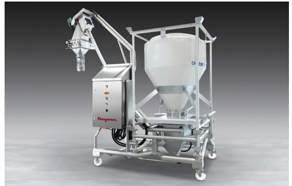
Flexicon Sanitary Mobile IBC Discharger can be rolled to multiple locations throughout the plant or to a cleaning station for rapid sanitizing.

The system is available in carbon steel with durable industrial coating, with stainless steel material contact surfaces, or in all-stainless steel (shown) finished to industrial, food, dairy or pharmaceutical standards.