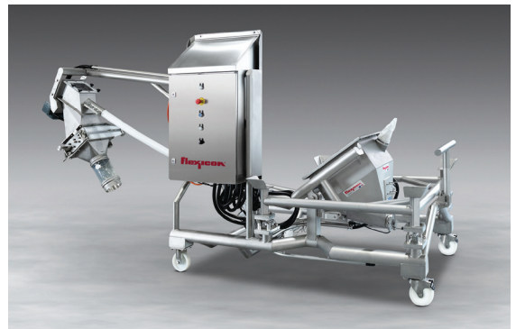
The support mast, flexible screw conveyor and hopper tilt down to maneuver in low headroom areas.