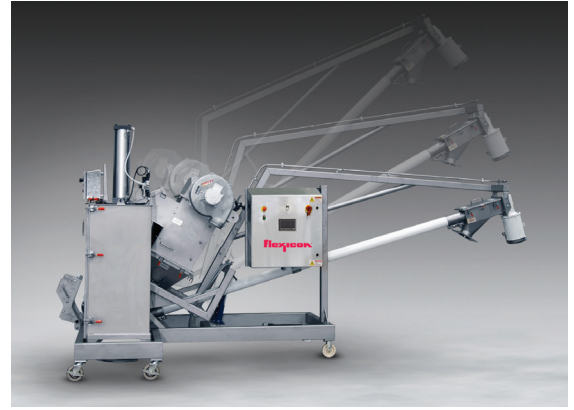
Flexicon Mobile Tilt-Down Flexible Screw Conveyor with Integral Bag Dump System can be deployed anywhere in the plant to transfer manually-dumped material into elevated process equipment, and compact empty bags, dust-free.

The system is available in carbon steel with durable industrial coating, with stainless steel material contact surfaces, or in all-stainless steel (shown) finished to industrial, food, dairy or pharmaceutical standards.