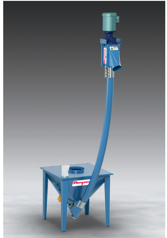
Flexicon all-steel flexible screw conveyor conveys crushed glass, garnet, aluminum oxide, silica sand, aggregate, cement and other abrasive materials dust-free.

Supplied as standard with a durable industrial coating, the unit is available with an optional UL-listed start-stop control panel and a range of flow-promotion devices.