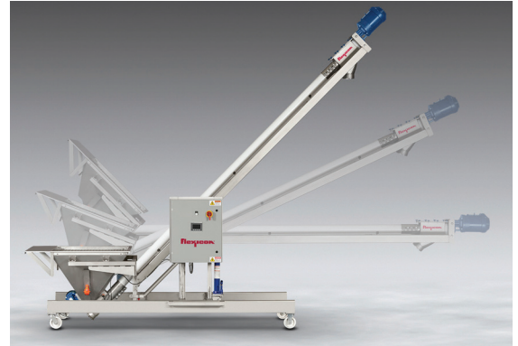
Flexicon Mobile Tilt-down Flexible Screw Conveyor with support boom positioned against and parallel to the conveyor tube can maneuver through low headroom areas, discharge in restricted spaces throughout the plant, and then roll to a wash down station.

A broad range of screws with specialized geometries is available to handle free- and non-free-flowing materials, including products that pack, cake or smear.