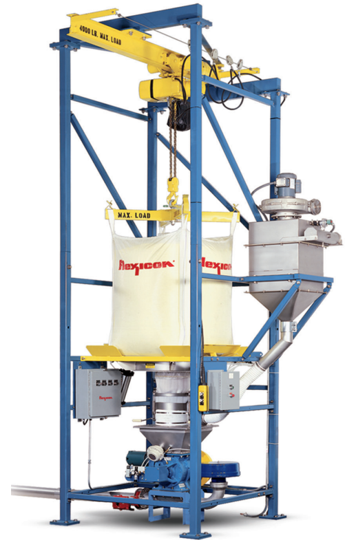
High-integrity seal allows full-open discharge from bulk bags dust-free

Construction is of carbon steel with durable industrial finish, or stainless steel finished to industrial, food, dairy or pharmaceutical standards.