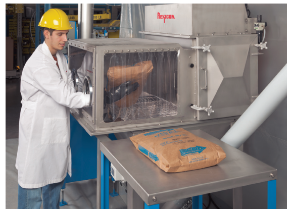
The operator is isolated from dust by means of a dumping hood comprised of a plastic strip curtain, glove box, empty-bag infeed chute, and dust collector atop a receiving hopper feeding an enclosed flexible screw conveyor.