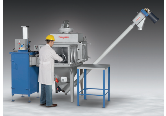
Dust generated from bag opening, dumping and compaction is isolated from the operator and plant environment by means of a glove box, dust collector and integral bag compactor with sealed infeed chute. An enclosed Flexicon flexible screw conveyor transfers material downstream at any angle, dust-free.

The hopper discharges into an enclosed Flexicon flexible screw conveyor for dust-free transfer of a broad variety of products including free- and non-free-flowing materials from large pellets to sub-micron powders, including products that pack, cake, seize, smear, fluidize, break apart or separate, with no separation of blended products.