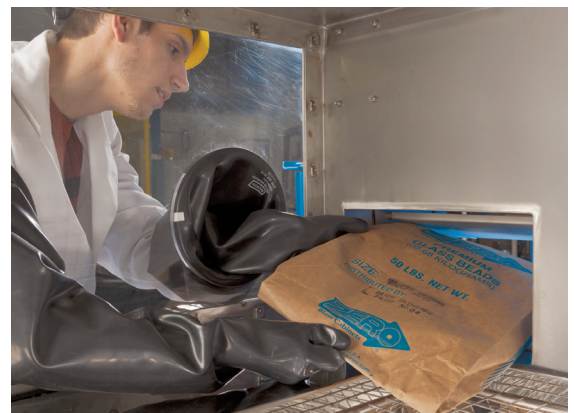
An operator transfers empty bags from the glove box side of the enclosure through a bag infeed chute in the enclosure sidewall, drawing dust generated from bag compaction as well as dumping activities into the integral dust collection system.