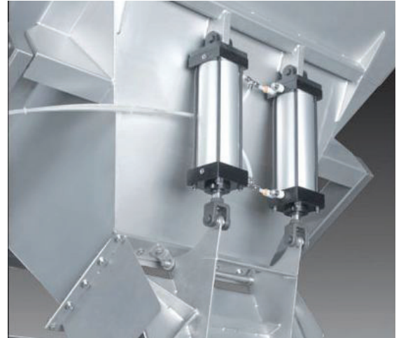
Actuated by twin pneumatic cylinders, the optional top discharge gate of the new Box-Container Dumper provides a large opening for the passage of non-free-flowing bulk solids.