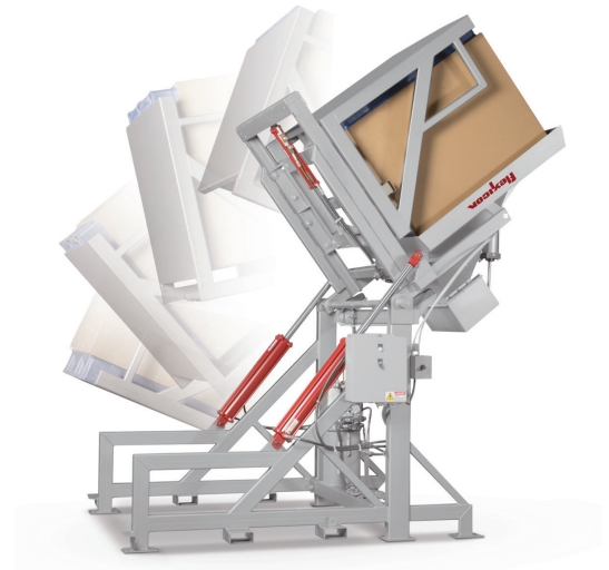
TIP-TITE® Box-Container Dumper from Flexicon forms a gasketed, dust-tight connection between the container and the equipment, tips the container to 60° past horizontal, and discharges bulk material through a chute at controlled rates.

It is available with optional receiving hoppers configured with the company's mechanical or pneumatic conveyors to transport discharged material to any plant location.