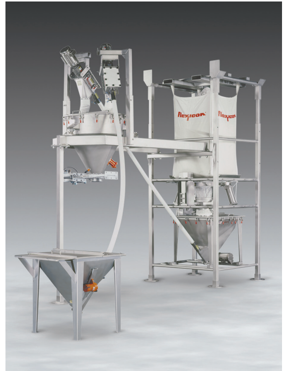
Sanitary Weigh Batch System sources ingredients from bulk bags and manually dumped sacks, boxes and other containers, under automated control.

The floor hopper is available with a containment hood including integral dust collection for clean, safe handling of dusty materials.