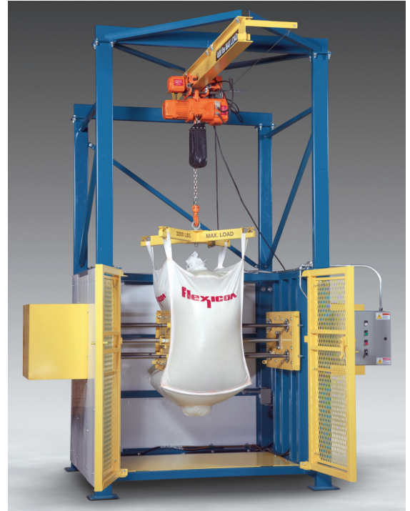
Bulk bags can be loaded, raised and lowered using the hoist, and rotated manually, for conditioning at all heights on all sides.

The conditioner is offered as a stand-alone unit or integrated with the company's BULK-OUT® bulk bag discharging systems.