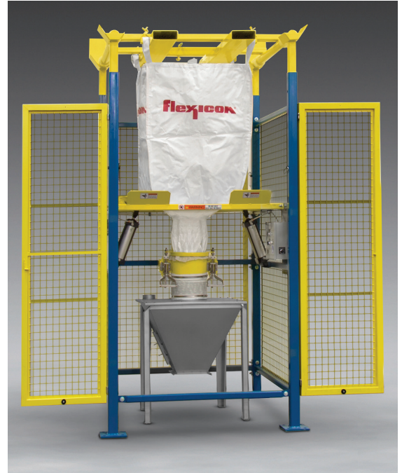
Steel safety enclosure of BULK-OUT® Model BFF Bulk Bag Discharger ceases operation of moving parts when safety interlocked doors are open.

The discharger is constructed of carbon steel with durable industrial finish and stainless steel material contact surfaces, and available in all-stainless steel finished to food, dairy or pharmaceutical standards.