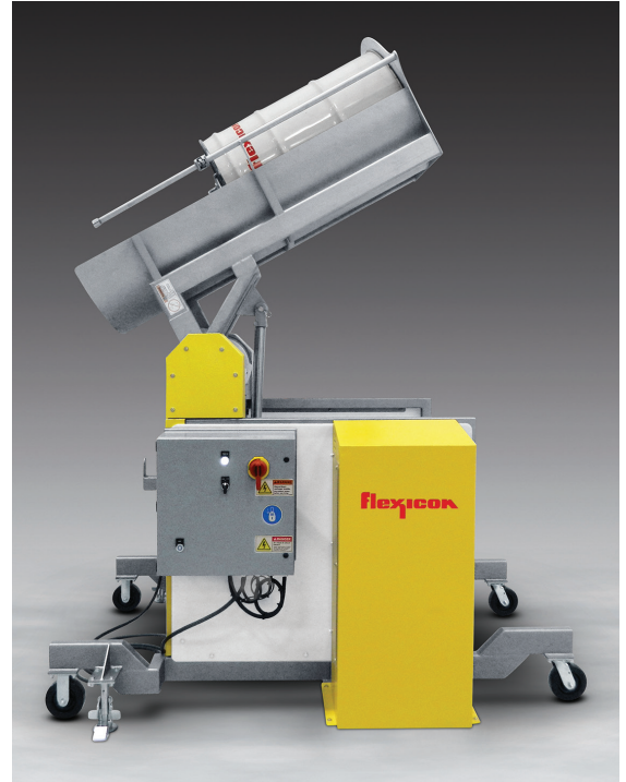
Flexicon Portable Sanitary Open-Chute Drum Dumper with smooth, wide-diameter chute rotates the drum to 60° beyond horizontal, allowing bulk material to discharge freely regardless of particle size.

Non-product contact surfaces are constructed of carbon steel with durable industrial coatings.