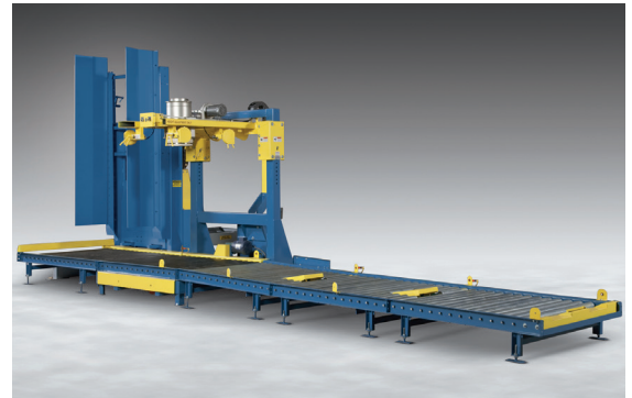
A 15-pallet dispenser releases the bottom-most pallet to roll beneath the cantilevered fill head of a bulk bag filler. Following manual connection of empty bags to the fill head, filling, densification and conveying functions are automatic.