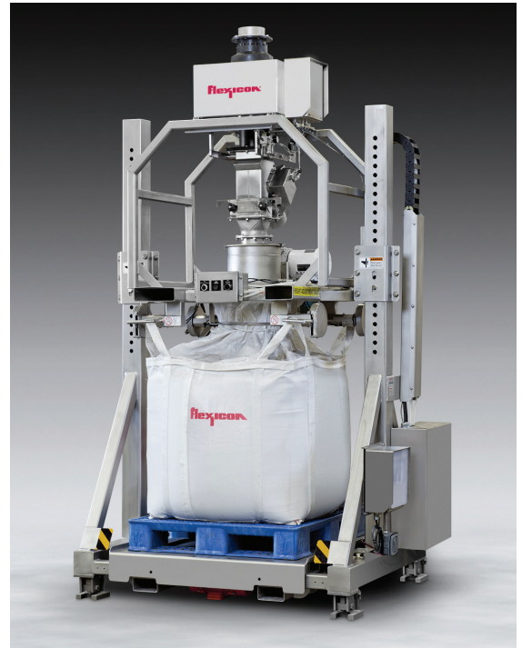
Sanitary, stainless steel TWIN-CENTERPOST™ Bulk Bag Filler with metal detection/removal weigh-fills and deaerates/densifies bulk bags, automatically and dust-free.

Once the operator connects an empty bag and presses “start,” weigh-filling functions are automatic; the controller runs the conveyor (or rotary valve) at high feed rate, actuates the vibratory deaeration/densification system, steps down the conveyor (or rotary valve) to dribble feed rate immediately prior to stopping it once the accurate fill weight is gained, and then releases the bag straps. The filled bag is then removed by forklift and the operator is clear to connect the next bulk bag.