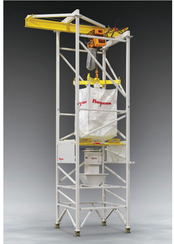
BULK-OUT® Bulk Bag Weigh Batch Unloader with seismic bracing provides structural integrity and added operator safety for installations in regions prone to earthquakes.

Also offered are BFF model unloaders for forklift loading of bags, and BFH half frame unloaders requiring a forklift or plant hoist to suspend the bag during discharge. All are available constructed of carbon steel with durable industrial finishes, or stainless steel finished to industrial or sanitary standards, with optional conveyors and weigh batching controls.