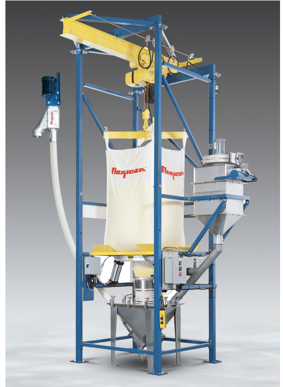
High-integrity seal allows full-open discharge from bulk bags dust-free

Construction is of carbon steel with durable industrial finish, or stainless steel in industrial or sanitary finish, including units designed and constructed for 3-A compliance.