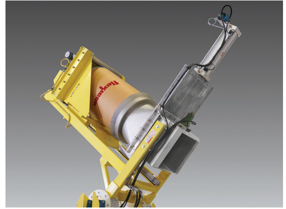
TIP-TITE® drum dumper for poorly-flowing or agglomerated materials, allows rapid transfer of bulk solid materials dust-free.

Other models are available for dumping of boxes, bins, pails and other containers.