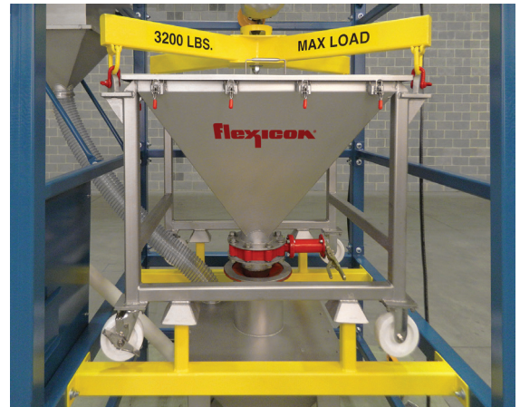
The portable IBC is fitted with eye bolts for connection to the lifting cradle, and inverted cradle cups that center the tapered outlet cone of a butterfly valve within the gasketed receiving ring of the surge hopper.