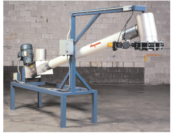
Drive motor at material inlet allows conveyor to fit in low headroom areas.

Low Profile Flexible Screw Conveyors are offered in diameters from 2-5/8 to 8 in. (64 to 203 mm) in stationary and mobile configurations to industrial, food, dairy and pharmaceutical standards, with optional hoppers, flow promotion devices, sensors, controllers and interchangeable screw designs to satisfy wide-ranging material and process requirements.