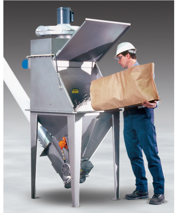
Filters are accessed easily by removing the interior baffle, and replaced rapidly using quick-disconnect fittings.

Hoppers are also available configured for connection to pneumatic conveyors or process equipment.