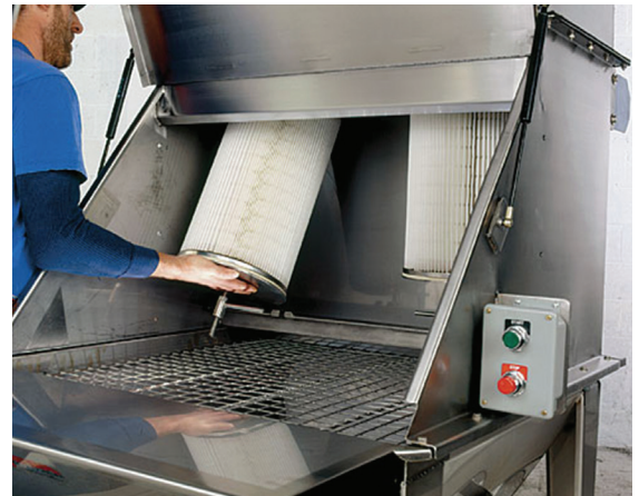
Timer activated solenoid valves release short blasts of air inside cartridge filters causing dust build-up to fall into the hopper. The hopper shown is configured for direct connection to a flexible screw conveyor. Other configurations allow connection to pneumatic conveyors or other conveyors and process equipment.