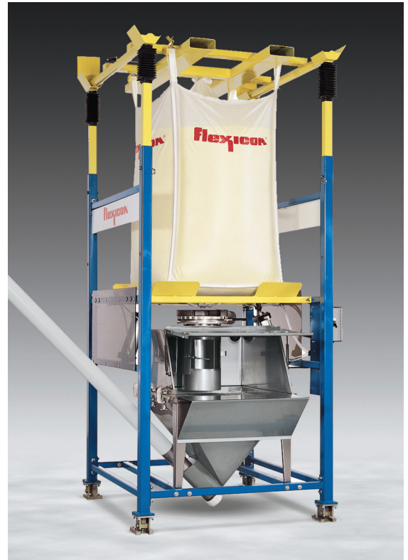
Raising the hinged door allows manual dumping of material into the hopper