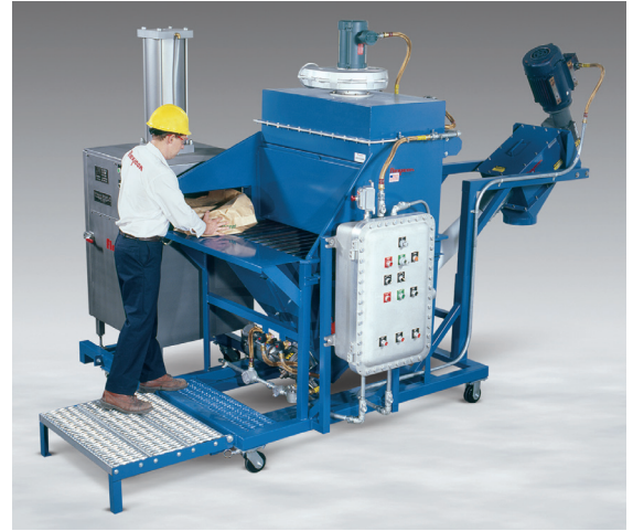
System integrates a hopper, dust collector, bag compactor and conveyor

Integrating system components capable of containing dust during dumping and compaction of bags as well as the conveying of dusty materials can address issues of plant hygiene more effectively than can separate equipment and, with the addition of an explosion-proof electrical system, allow it to handle flammable as well as hazardous and non-hazardous materials throughout the plant.