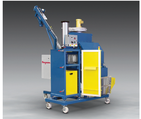
Dust generated from bag dumping and compaction is drawn onto cartridge filters equipped with air nozzles that cause collected dust to fall into the hopper on a timed cycle, conserving useable material while protecting plant personnel. An enclosed flexible screw conveyor transports material at any angle.