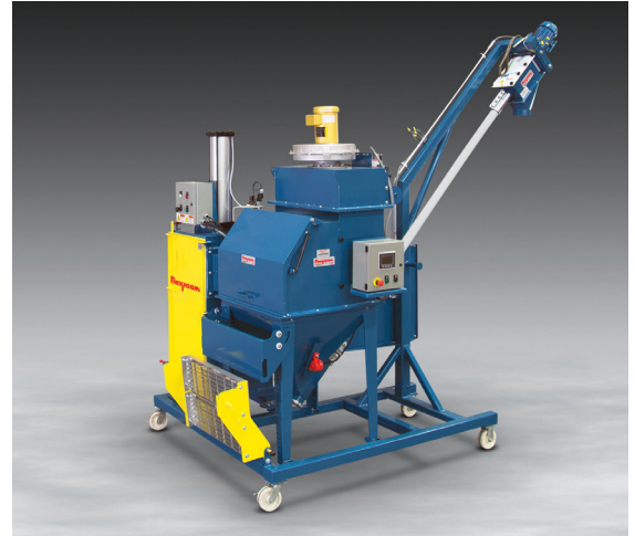
This Manual Bag Dump Station from Flexicon can serve multiple locations, compact empty bags, contain dust, and convey small additions from bags or boxes to downstream equipment.

The unit is constructed of carbon steel with durable industrial finish, and available with stainless steel contact surfaces or in all-stainless models finished to industrial, food, dairy or pharmaceutical standards.