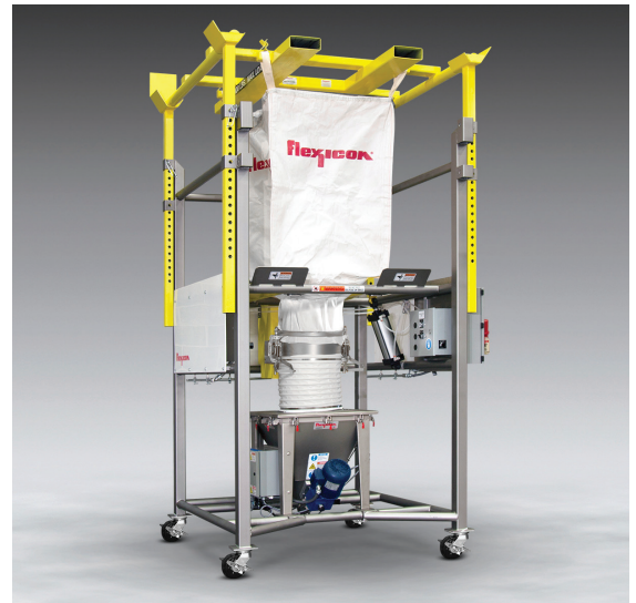
Flexicon Mobile Sanitary Bulk Bag Discharger can be rolled to multiple destinations throughout the plant.

The system is also offered in all-stainless construction to food, dairy, pharmaceutical and industrial standards, and in carbon steel with durable industrial coatings.