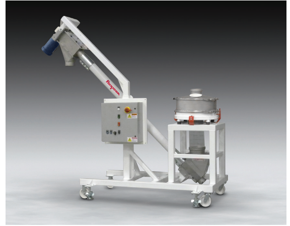
Flexicon's new BEV-CON™ Mobile Flexible Screw Conveyor system screens and elevates free- and non-free-flowing bulk materials at multiple plant locations and allows rapid sanitizing.

A lower clean-out cap can be removed to flush the smooth interior surfaces with steam, water or cleaning solutions, or to fully remove the flexible screw for cleaning and inspection.