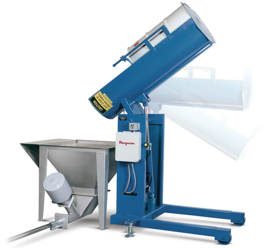
Open Chute Drum Dumper accommodates drums of all popular sizes.

Flexicon also produces TIP-TITE™ drum dumpers for applications requiring total dust containment.