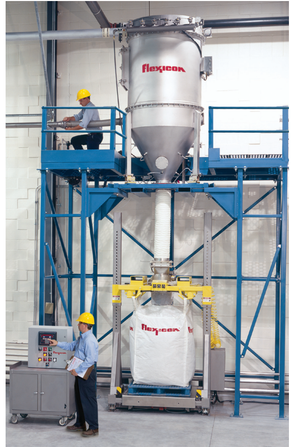
A PNEUMATI-CON® pneumatic conveying system weighs material and discharges it into a TWIN-CENTERPOST™ bulk bag filler at high rates, dust-free.

While filled bags are being removed and empty bags attached, a subsequent batch is being conveyed to the filter receiver and weighed, ready for another fill cycle.