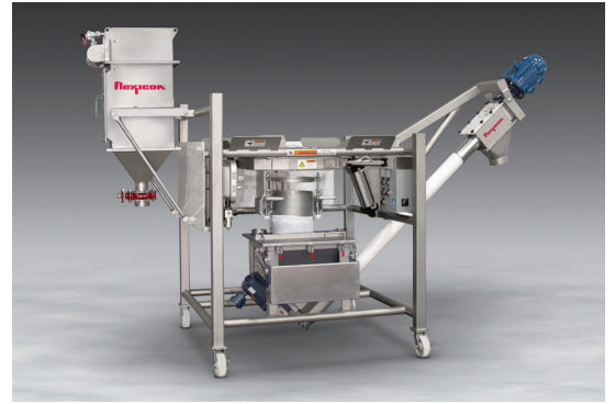
Flexicon mobile half-frame Bulk Bag Discharger with manual Bag Dump Station and integral Flexible Screw Conveyor can serve multiple functions throughout the plant.

The system is offered in all-stainless construction (shown), with stainless material contact surfaces, or in carbon steel with durable industrial coatings.